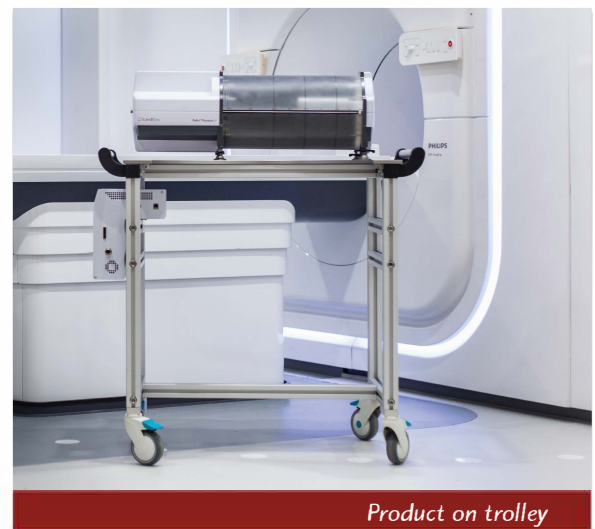
Product on trolley