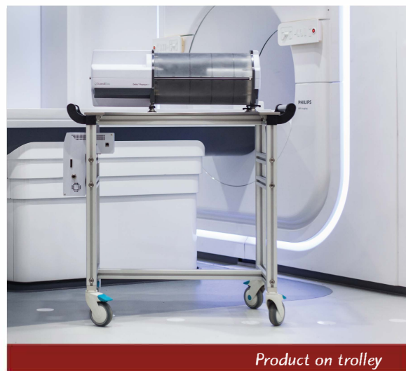
Product on trolley